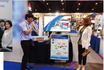
Research findings exhibited in Thailand were featured in a television program.