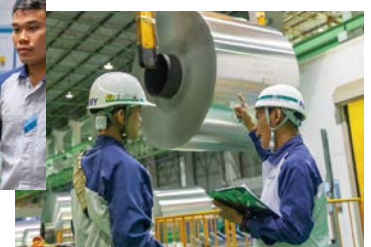
Routine instructions are given to raise awareness of safety.