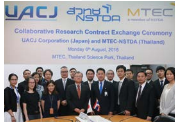
AI is being applied to test corrosion resistance in collaboration with MTEC.

In October 2018, UACJ set up a new R&D center in suburban Bangkok to provide technical support to UACJ Thailand. The new facility has been working to develop products tailored to the local market. For example, taking into account the country's climate and usage conditions, it has been testing the corrosion resistance of developed materials in collaboration with Thailand's National Metal and Materials Technology Center (MTEC). In addition to developing products, the R&D center is training people through joint-research with national universities, and endorses Thailand 4.0, the country's long-term vision for its economy and society, with a view to contribute more broadly to national development.