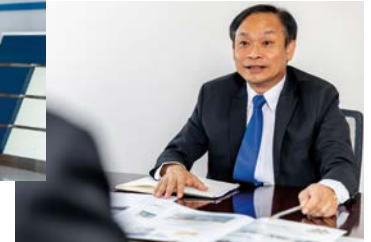
New products have been attracting greater interest from customers.