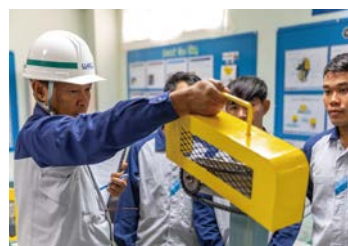
Components of equipment are explained to ensure safe operations.

understand that UACJ Thailand has an important obligation to ensure safety for its employees and local residents as a world-class manufacturer of aluminum products. In my role as senior manager of the Safety Department, I oversee safety training and inspections, and appreciate the need to raise awareness of safety among employees through routine activities. The company's efforts are clearly working, demonstrated by the fact that our accident-free periods and safety-related results are now on par with the Group's factories in Japan. Our safety management has evolved together with the company's rapid expansion, and I am proud of our local employees for independently operating and managing those facilities.