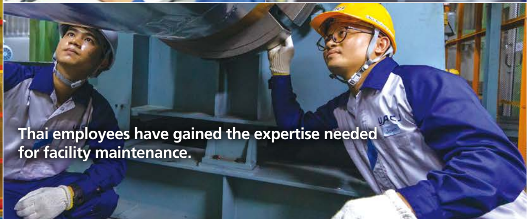
Thai employees have gained the expertise needed for facility maintenance.