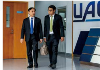
The company's growing expertise has led to more opportunities for business negotiations.

UACJ Thailand's sales volume has been increasing each year. More recently, its flat-rolled aluminum is often seen in products throughout the country, particularly leading brands of canned beer. This is the result of the company's excellent reputation for productivity and quality among customers, which is also attested by growing inquiries from domestic manufacturers and global firms. Now that it is fully operating, UACJ Thailand is contributing to the country's rising exports to Vietnam, Cambodia, and other ASEAN countries, which the Thai government has been actively promoting. By boosting sales of aluminum products, the company hopes to continue contributing to economic development and prosperity in Thailand and neighboring countries.