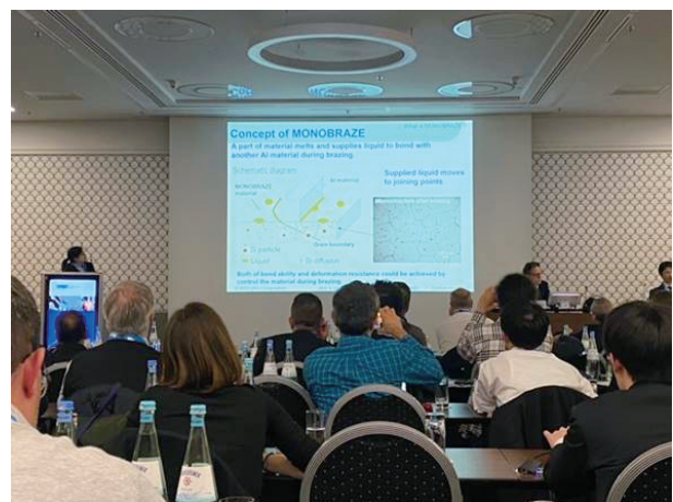
Fig. 2 UACJ presentations at the conference.