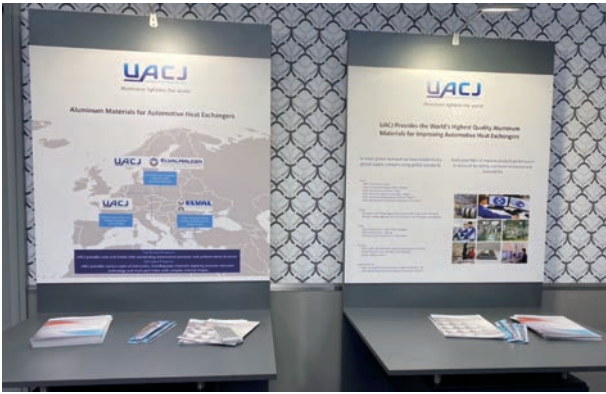
Fig. 3 UACJ booth in the exhibitor area.

In this year's event, many of the contributions were related to how future E-mobility will impact thermal management and braze materials and also related to the future importance of creating more